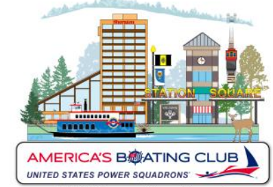
Fall Governing Board September 24 - 29, 2024 Pittsburgh, Pennsylvania