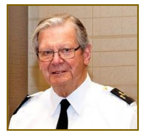
Photo from the 2023 D9 Spring Conference and Change of Watch in Bay City, MI Host: Saginaw Bay